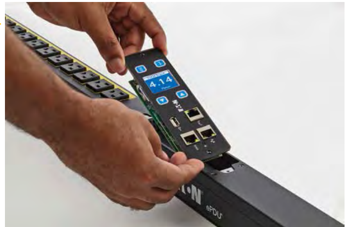
Module being removed without removing power to the ePDU

Eaton's new hot-swap eNMC (ePDU Network Management and Control) module can be replaced without the need to power down your rack. Increase uptime while enhancing serviceability and saving on unnecessary service calls. The menu-driven pixel display allows for easy setup and troubleshooting.