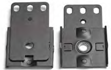
Eaton patented clip feet